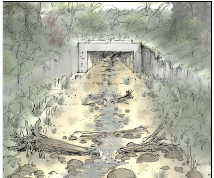
Conceptual drawing of finished culvert with creek flowing under 45th Ave. SW.

As reported here in March, the intersection of California Ave. SW and Director will be temporarily