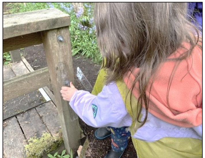
Students from the Urban Nature Preschool searched high and low on bridges for exoskeletons that stoneflies left behind.