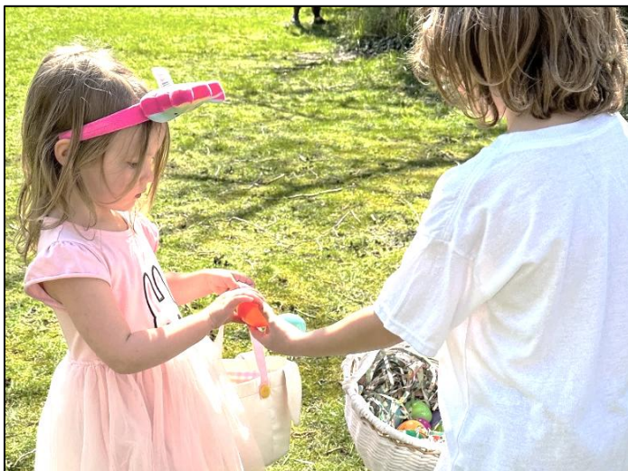
By sharing the bounty, these two hunters both had several eggs in their baskets.