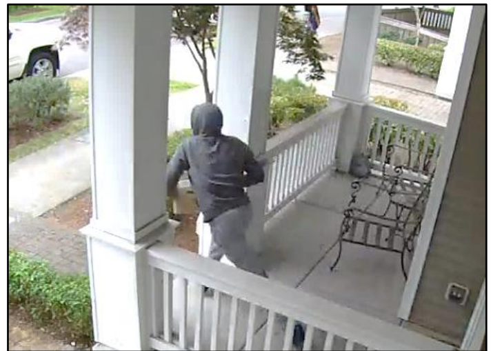
A thief flees with package in hand from a front porch in West Seattle.