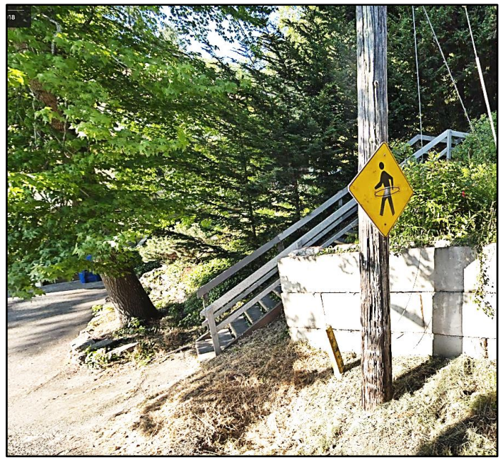
The base of the 50th Ave. SW/SW Roxbury staircase is on 50th between 9680 and 9800.

Visit faculty.washington.edu/smott/SeattleStairs.html to check out Seattle's other 650+ staircases and to find a map of the above routes.