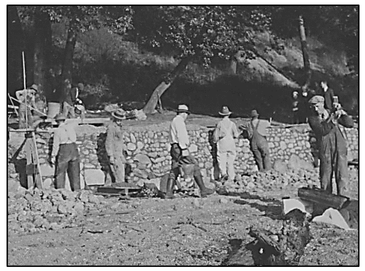
(Above) Strong backs, augmented by horsepower, had the seawall well under way in 1934. (Below) Two years later, construction was nearing Point Williams. Courtesy Seattle Municipal Archives, #29742, #29700