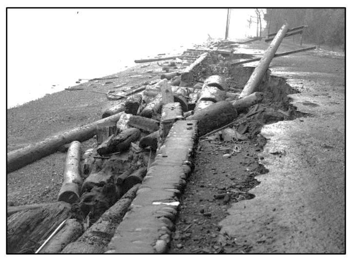
Storm damage in 1951 seriously damaged the south seawall and promenade. Courtesy Seattle Municipal Archives, #42581

Within 20 years, the south wall's ability to withstand powerful waves proved inadequate. Wear and tear compelled the city to build replacement sections with a wider base and reinforce the toe with more concrete. Starting in the 1980s, the city implemented a U.S. Army Corps of Engineers plan to deposit tons of rock and sand at the foot of the wall to "renourish" the beach.