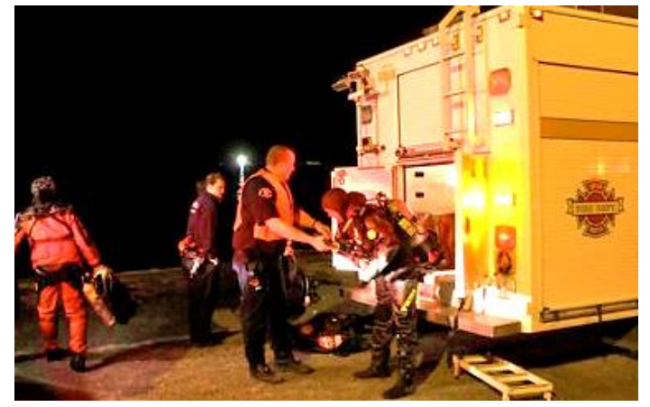
For many years, the Seattle Fire Department has been responding to water rescues off Lincoln Park. The West Seattle Blog captured this action in 2012.

Because they respond to water rescues there throughout the year, crews at nearby fire stations are familiar with Lincoln Park's acreage and trails.