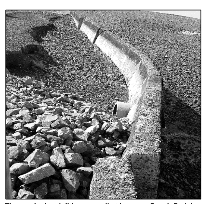
The cracked and tilting seawall at Lowman Beach Park is allowing erosion.

Watch the West Seattle Blog for notice of the public meeting or track progress at www.seattle.gov/parks/find/parkslowman-beach-park . For specific questions about the project, email david.graves @seattle.gov or call him at 206-684-7048.