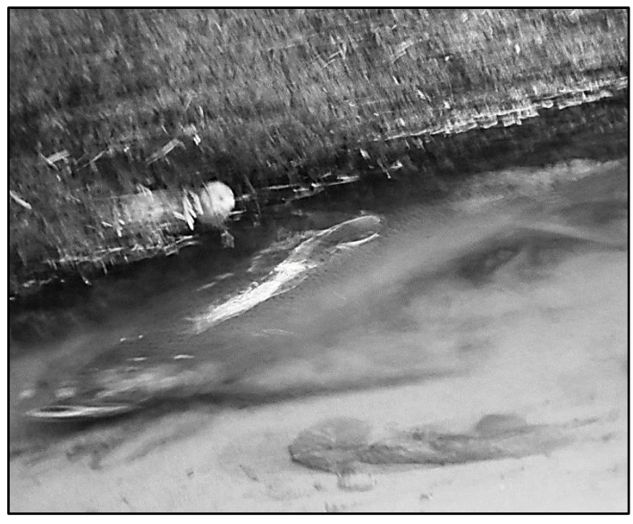
This coho spawner in a hurry was one of 18 on Fauntleroy Creek this fall.

FREE In-Home Assessment 206-420-4934 SynergyHomeCare.Com