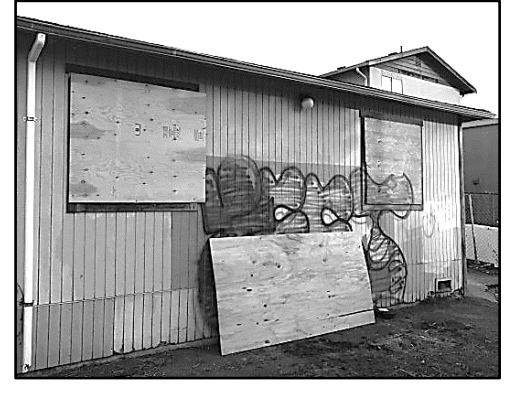
Fire took this derelict West Seattle house to the ground in 2017 after squatters had caused two prior blazes.

Since then, Mike has been collecting permission signatures from fellow beachfront owners around the cove. Kristian expects DNR to start a series of periodic removals in January, as weather permits. Crews comprised of staff and AmeriCorps volunteers will remove the logs using landing craft, cut them into 4-foot sections, and take them to a landfill approved for creosote disposal.