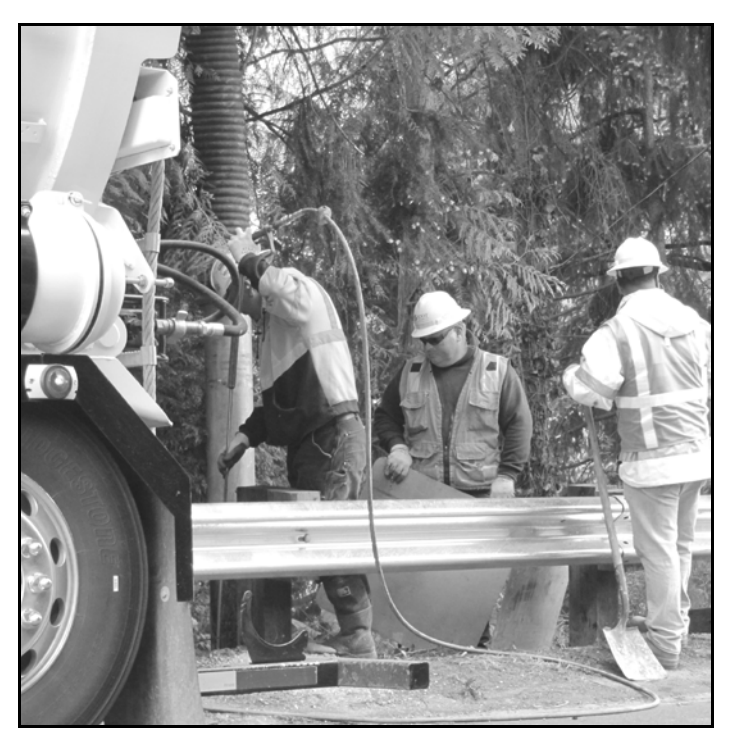
An SDOT crew and contractor prepared another segment of Marine View Drive SW for guardrail installation.