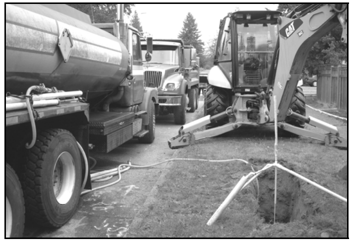
Pits like this one tested how quickly water soaked into the soil at shallow depths.

King County is getting closer to a design for green stormwater infrastructure in the Sunrise Heights and Westwood neighborhoods aimed at reducing combined-sewer overflows into Fauntleroy Cove (Barton basin). The project will consist of planted areas called bio-retention swales located