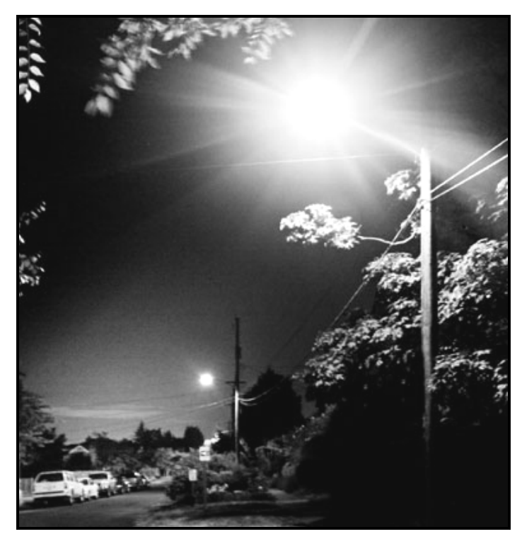
How white the LED streetlights in Fauntleroy will be depends on resident response in test sites around the city.

high-pressure sodium lights, LED fixtures allow close control over where illumination falls. City Light crews are installing them for zero up-light.