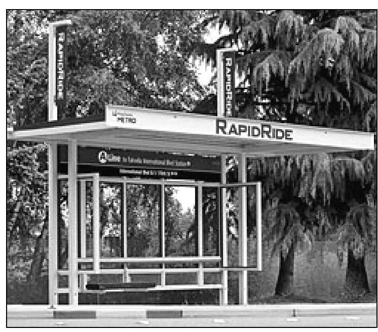
RapidRide stations are to be brightly lit for safety and visibility and covered for weather protection. Prototype

The behind-the-scenes advocacy that culminated in a RapidRide proposal that the community could support began immediately after the FCA Board saw the initial