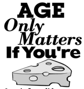
Savor the flavor of life at any age.

The plot is simple: Former sweethearts reconnect at their college reunion, love rekindles, offspring object to wedding plans, then come around and all ends well.