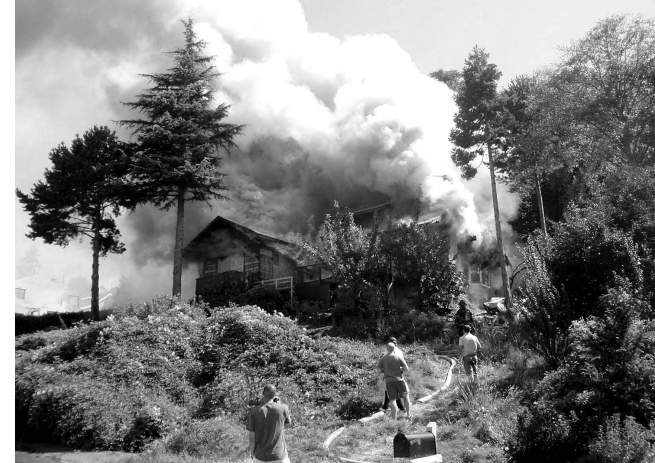
The Training Exercise

of the run down house in the 10000 block of 47<sup>th</sup> Ave SW offered their house to SFD so it could be set ablaze to help train recruits. It was quite a spectacle. Neighbors on 47<sup>th</sup> Ave SW, family and friends of the recruits and the construction workers on the new house next door turned out to watch. Several ferry passengers arriving from Vashon or Southworth saw and reported the fire south of the Ferry Dock only to find out it was a training exercise. The recruits passed their test and contained the fire.