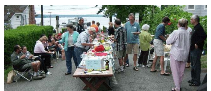
4500 Block SW Henderson

held parties every year since the Night Out program began. They even have a banner. They are proud to proclaim they have had an organized Block Watch program for 16 years and, in keeping with the theme of Neighborhood Night Out, they hold disaster preparedness meetings and instruction every year as a regular part of their festivities.