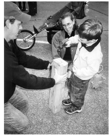
And a good time was had by all! Be sure to come back for this year's Fauntleroy Fall Festival and sign up to be a volunteer! It's fun, it's easy, your help is needed!