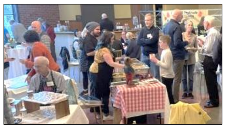
FCA hosted a full house for the FCA Annual Meeting and Food Fest. Most FCA officers and board members were able to be present to chat with fellow residents.

Donations to keep the event free for the community came from a raffle and a portion of sales during special days at Endolyne Joe's, the Bird House, and Wildwood Market. Donations when FCA members paid dues also helped, as did a portion of the sale of Fauntleroy sweatshirts at multiple locations.