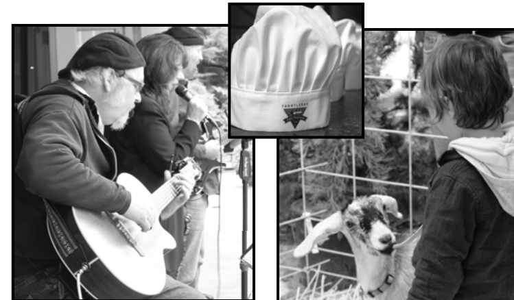
Music by the Five Buck Band, sustainable urban goats from the Seattle Farm Co-Op, and a custom chef's hat prize for cake-decorating creativity at the Fall Festival.