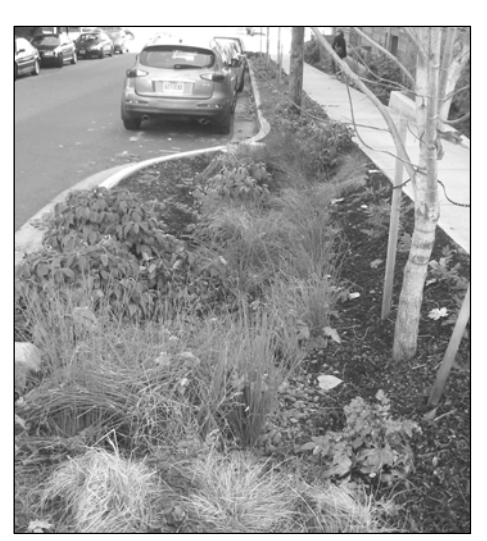
Rain gardens such as this along residential streets up the hill could retain water where it falls.

In what officials described as a difficult decision, the county has proposed to reduce CSO's from