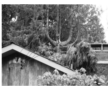
One of many houses decorated by nature

and unpredicted torrential rain hit us just as the wind was picking up. Water cascading down streets carrying leaves and debris soon plugged storm drains