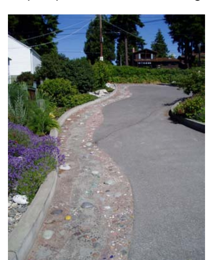
"Streambed" along walkway

ished during construction include portions of the site's parking area/driveway, landscaping, a walkway