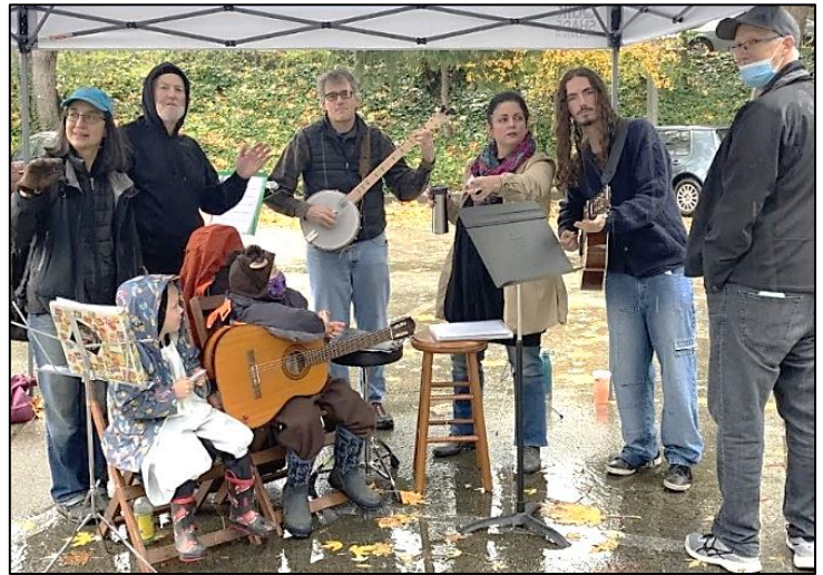
Members of the B Sharp Band set a lively tempo for the festival.