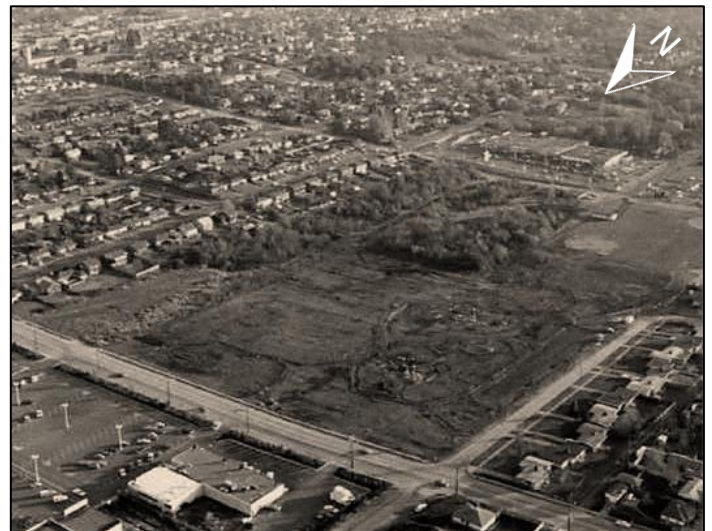
(Below) This 1969 photo looking southeast over Roxhill Park shows a portion of Westwood Village in the lower left and the residential housing that proliferated east and west of the park.

city parks, including the Highland Park playground at 10th Ave. SW and SW Cloverdale. In addition to anti-aircraft guns, the encampment had one of the many searchlights employed during the war to defend against aerial attack. Jane draws the connection between the personnel there and the nearby bog.