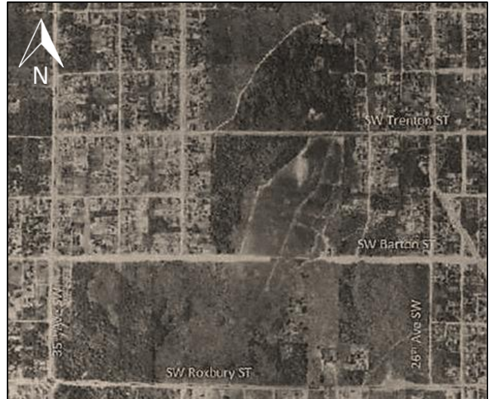
(Above) This 1936 photo shows the full extent of the bog before paving of SW Barton St., construction of Westwood Village, and creation of Roxhill Park.

The families were forced to abandon their land after Pearl Harbor but others soon took advantage of the peat. The 73rd Coast Artillery Regiment set up shop in several