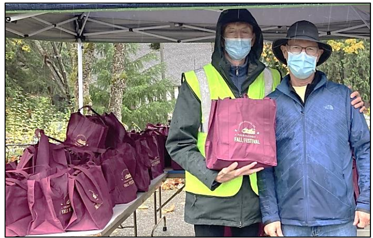
Festival-goers had goodie bags to explore when they got home.