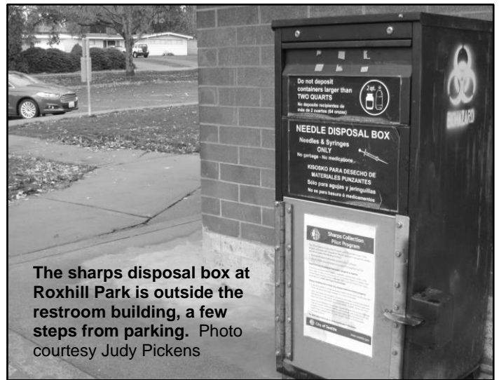
The sharps disposal box at Roxhill Park is outside the restroom building, a few steps from parking.

Thirteen area schools will be receiving eggs in January to rear for release in May.